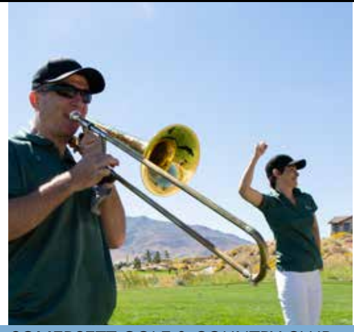
SOMERSETT GOLF & COUNTRY CLUB, MUSIC & MULLIGANS

GREATER NEVADA FIELD, MUSIC OF JAMES BOND